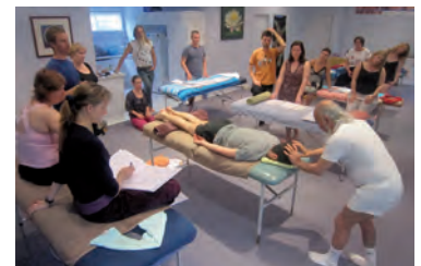
Emotional Release Alignment

Combine your understanding of Psychosomatic Therapy and Quantum Physics.