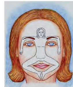
Every part of our body is in etched in the face.

From the moment of birth till the very end of life every human being yearns for worthiness, attention, safety and love from the heart. This is Psychosomatic Therapy!