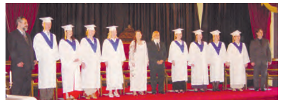
Diploma Graduates above - Canada: below - Australia